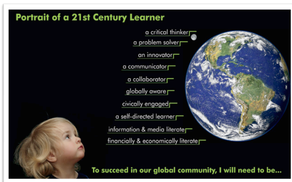
Figure 1: Portrait of a 21 st Century Learner 3